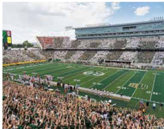
CSU Canvas Stadium