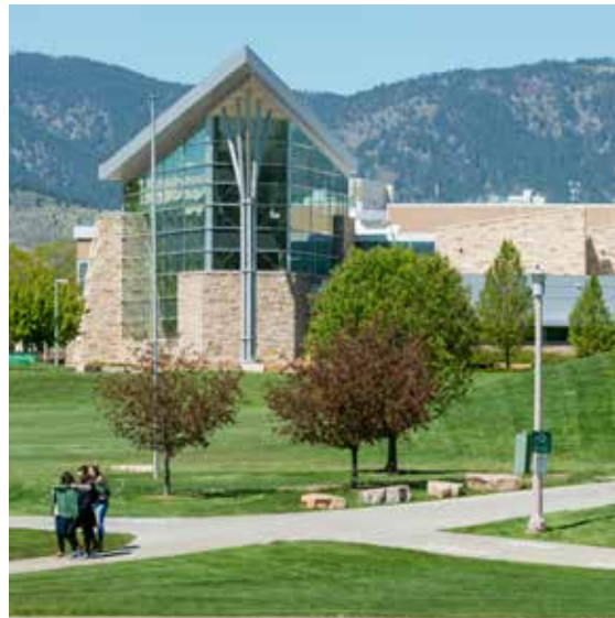
Student Recreation Center